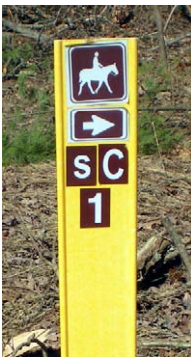
Typical Allegan County Equestrian Trail Marker. You will find these markers along the trails and at trail junctions.